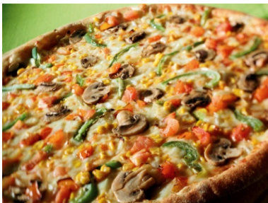
The Domino's Pizza experience. Too good to miss.